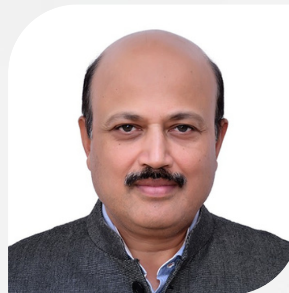
SHRI. RAJESH AGRAWAL (TBC) ADDITIONAL SECRETARY, DEPARTMENT OF COMMERCE, GOVERNMENT OF INDIA