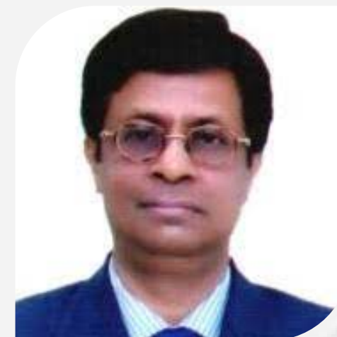
SHRI SUMANTA CHAUDHURI PRINCIPAL ADVISER INTERNATIONAL TRADE POLICY, CONFEDERATION OF INDIAN INDUSTRY